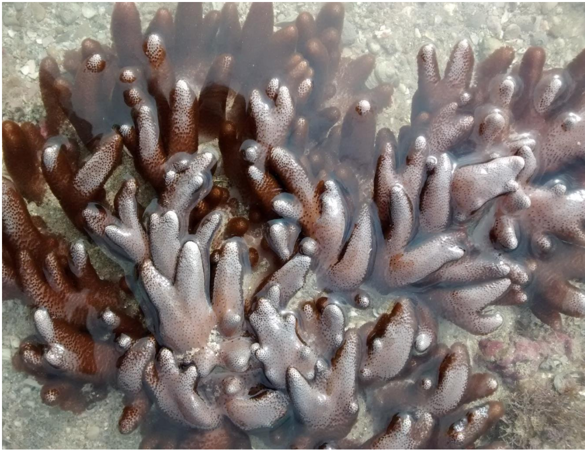
Figure-2 Soft coral colony, Simularia polydactyla recolonized on the Chandri Reef